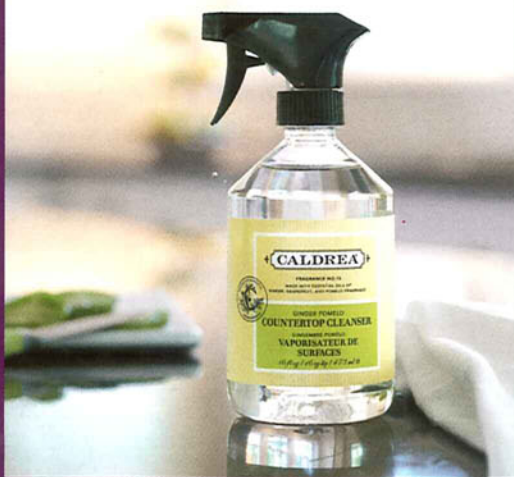
The Caldrea Company