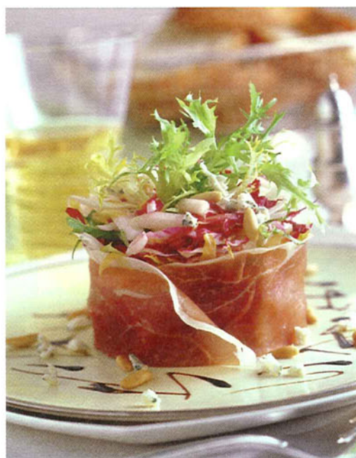
This Apple & Endive Salad with Prosciutto di Parma is just one of the elegant examples of how this Italian specialty ham can be served. For more recipe ideas, contact the Prosciutto di Parma Consortium , 212/420-8808 or www.parmaham.com

Keeping a gourmet kitchen fresh is more fun with upscale cleansers and fragrances.