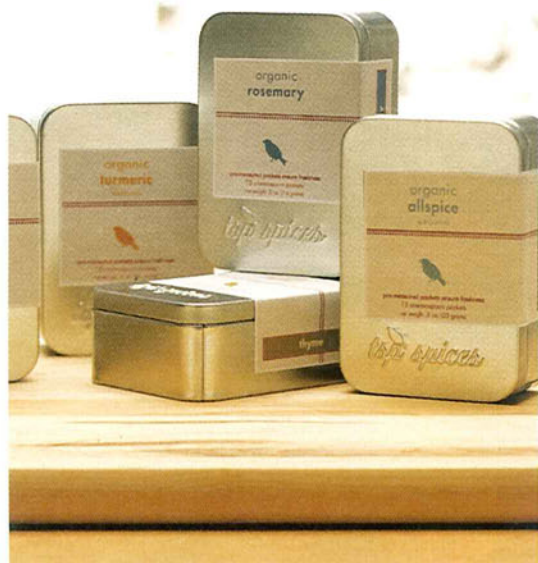
TSP Spices make it easy to portion out spices needed for a recipe without waste. The organic spices come in giftable tins (containing 12, 1-tsp. packs). Single spice and combo sets are available. Suggested retail: individual cans, $9-$12; twin sets, $20-$28; basics sets (six cans), $45-$55. From TSP Spices , 443/386-2889 or www.tspspices.com